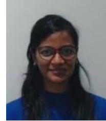
Varsha Creative Producer