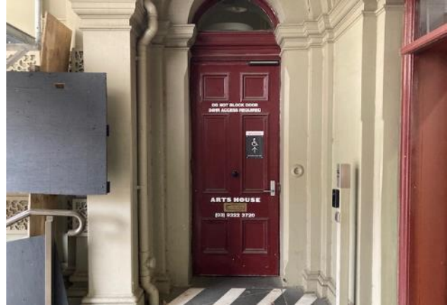
Image: View of door entrance.

Image: Errol Street entrance next to the Post office with wheelchair accessible ramp or two steps with grab rails.