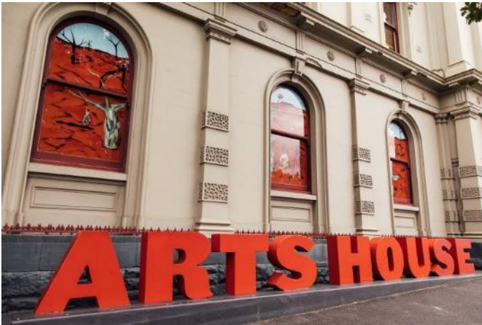
Image: North Melbourne Town Hall features giant red letters that say ARTS HOUSE out the front of it.