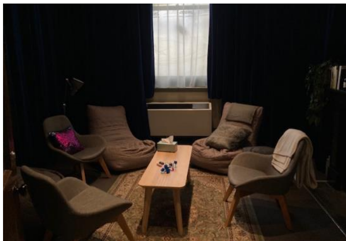
Image: Quiet space with lights dimmed

Arts House Quiet Space is located on Ground Level and is nearby reception and opposite the accessible bathrooms. It includes a range of seating options including soft furnishings, dimmable lights, sensory and stim objects. It is open during venue opening hours and events as a quiet space, prayer or parenting space.