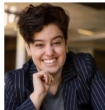
Artemis Access Advisor