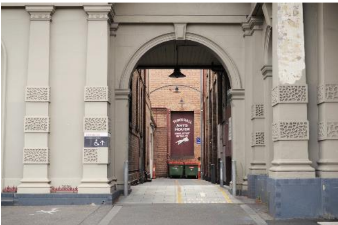
Image: View of George Johnson Lane from Errol St. The laneway passes through an archway with a brick wall at the end.

The second Accessible Entrance is towards the end of George Johnson Lane.