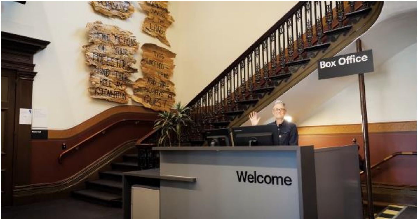
Image: The reception desk, showing one of our Arts House staff waving and smiling. To the left of the reception desk is the main stair case, showcasing some art work on the walls. Reception is located in the foyer at reception under the stairwell.