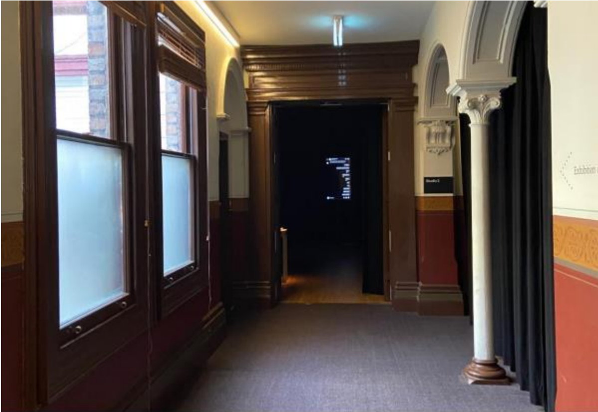
Image: A corridor with windows on the left side and curtains on the right side. At the end of the hall there is the doorway entrance into Studio 2. The doors are open and inside is dark, showing a slight display of a projected artwork inside.

The Neighbourhood Gathering is in Studio 2, located on level 1. You can access this space via stairs with hand-railing or the lift.