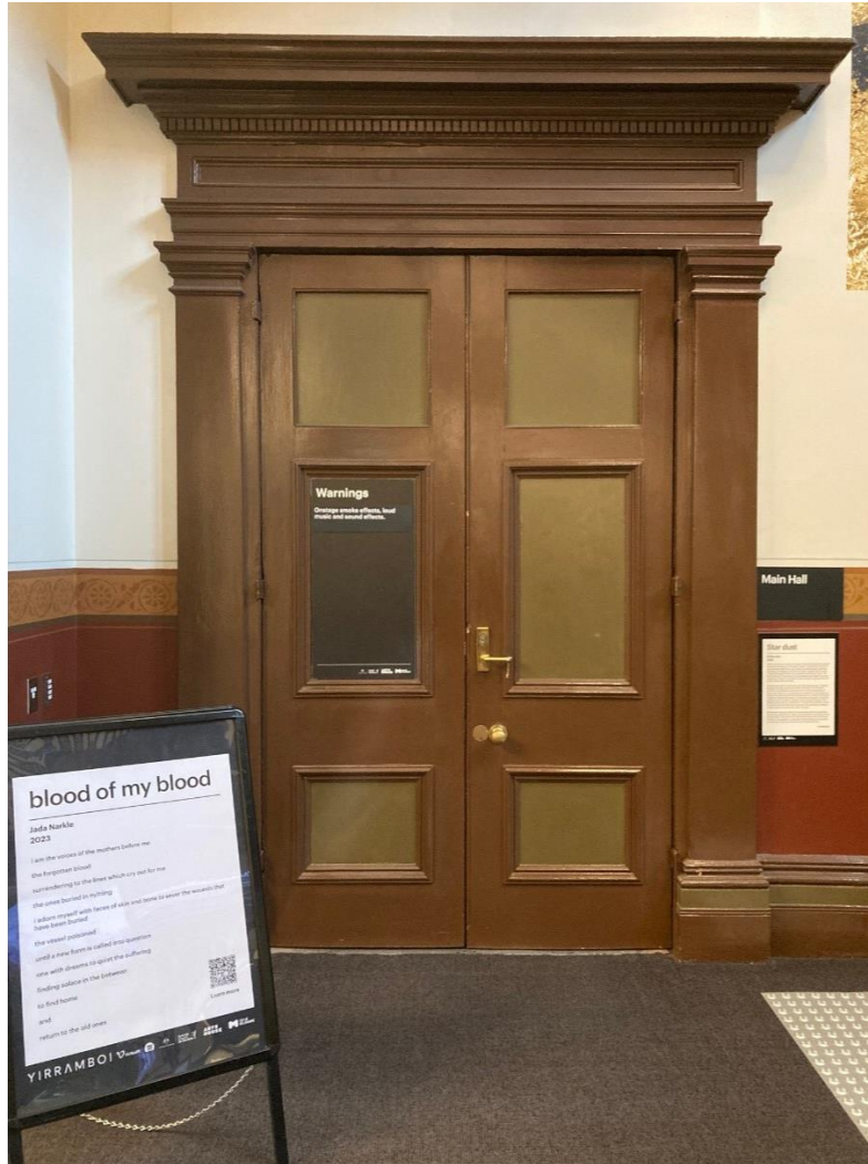
Image: Large doors that are

If taking the staircase down, the Main Hall is at stairs landing.