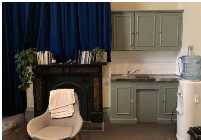
Image: Quiet space kitchenette and book shelf