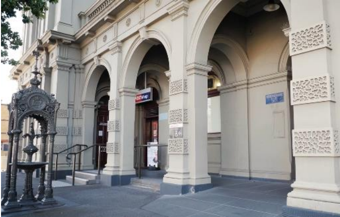
Image: Errol Street entrance next to the Post office with wheelchair accessible ramp or two steps with grab rails.

There are two Accessible Entrances. The first is on Errol St next to the Post Office.