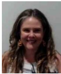
Louana Creative Producer