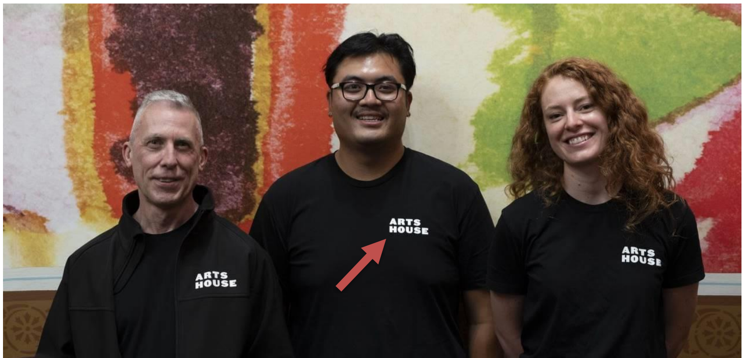
Image: Three Arts House Ushers. Ushers will be wearing black with an Arts House Logo on the left hand shoulder.