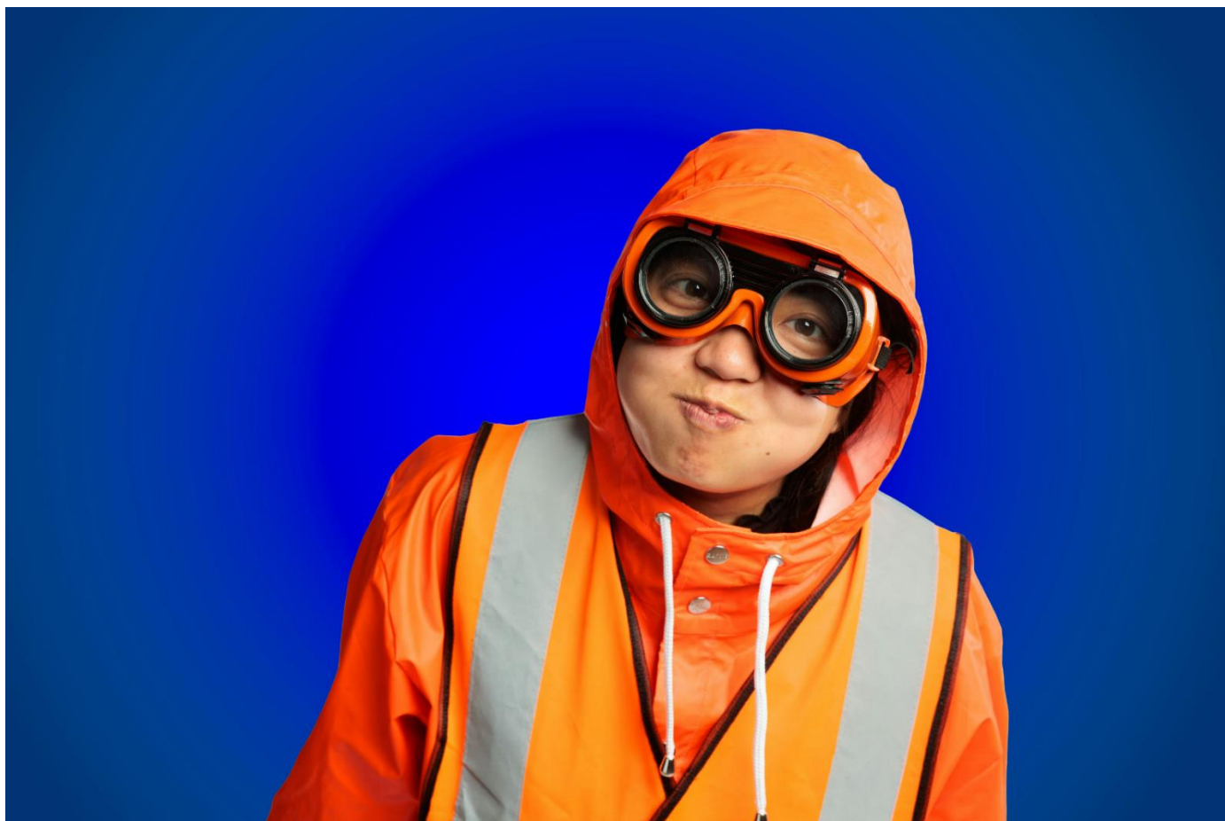
Image description: A young person wearing bright orange high vis vest, raincoat and safety goggles, stares directly at the camera. They puff out their cheeks with tightly closed lips as they hold their breath with a slight smile on their face. They are contrasted against a bright blue background.