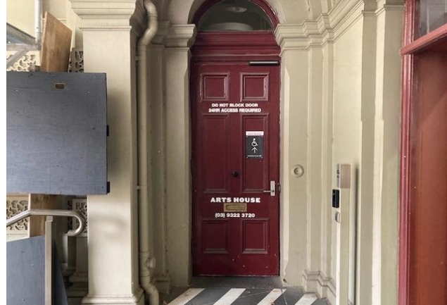
Image: View of door entrance.

Image: Errol Street entrance next to the Post office with wheelchair accessible ramp or two steps with grab rails.