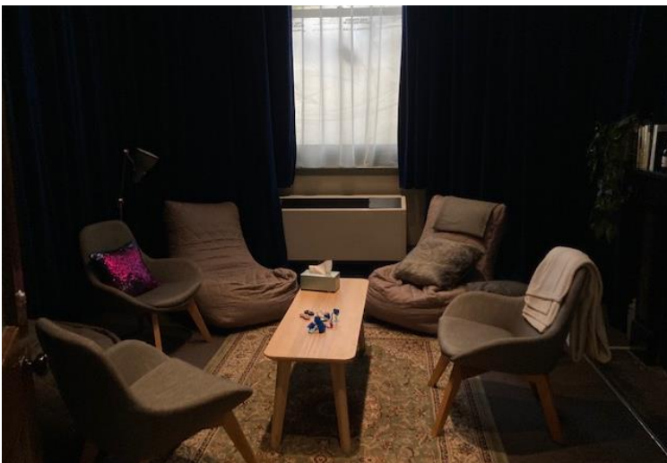
Image: Quiet Space with lights dimmed