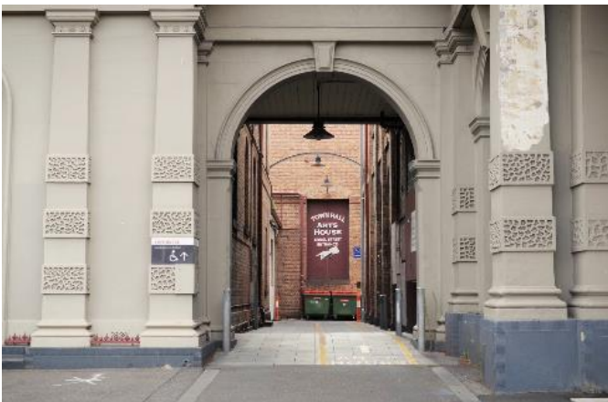
View of George Johnson Lane from Errol St. The laneway passes through an archway with a brick wall at the end.

The second Accessible Entrance is towards the end of George Johnson Lane.