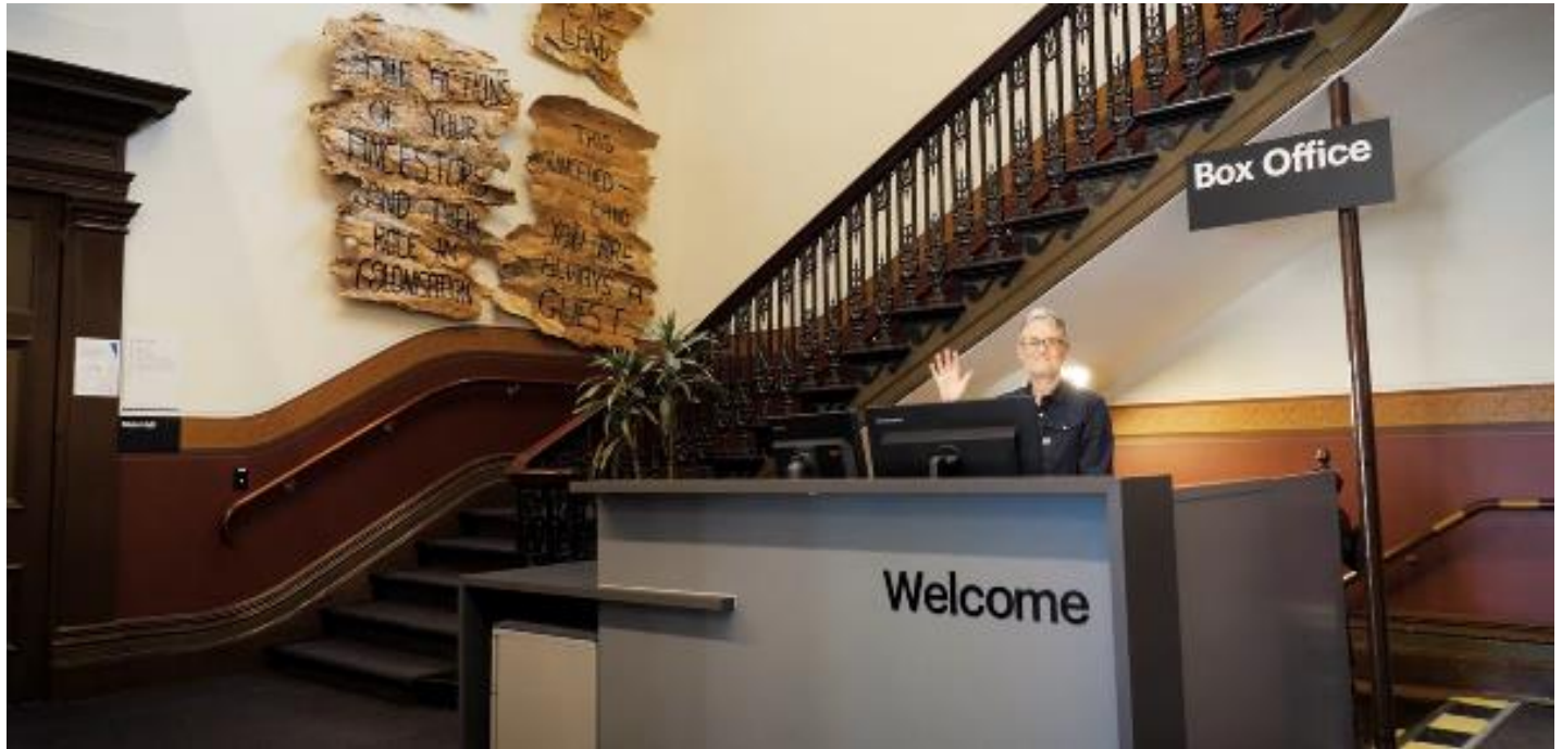
Image: Reception desk. Box Office / Reception Desk is located in the foyer under the stairwell.