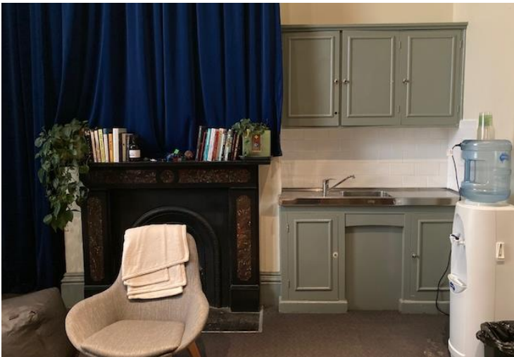
Image: Quiet Space kitchenette and shelf

Arts House Quiet Space is located on Ground Level and is nearby reception and opposite the accessible bathrooms. It includes a range of seating options including soft furnishings, dimmable lights, sensory and stim objects. It is open during venue opening hours and events as a quiet space, prayer or parenting space.