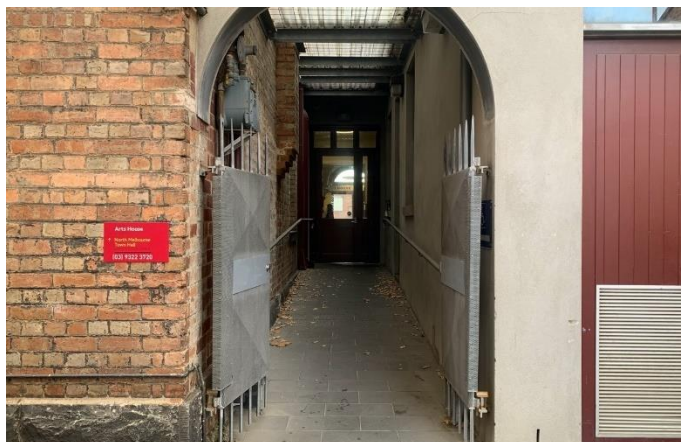
Image: view of the ramp leading from George Johnson Lane to the automated door which opens into the Arts House foyer.

Image: View of George Johnson Lane from Errol St. The laneway passes through an archway with a brick wall at the end.