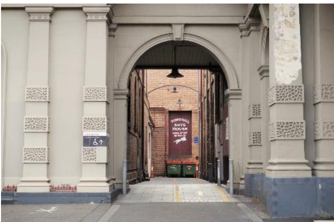
Image: View of George Johnson Lane from Errol St. The laneway passes through an archway with a brick wall at the end.

The main party entrance is via George Johnson Lane from Errol Street, North Melbourne. This entrance is wheelchair accessible and has grab rails either side.