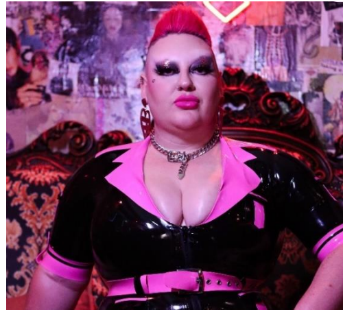
Performer: Kitty Obsidian