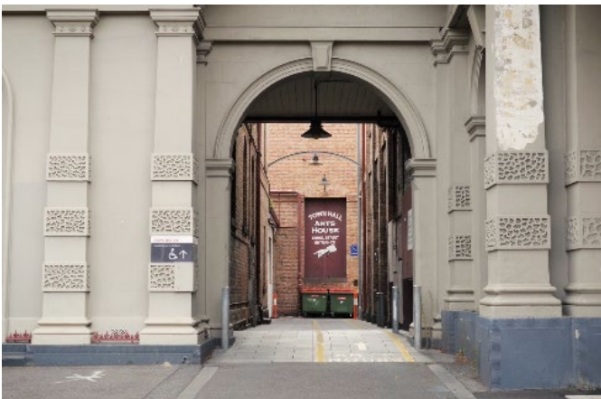
Image: View of George Johnson Lane from Errol St. The laneway passes through an archway with a brick wall at the end.

The second Accessible Entrance is towards the end of George Johnson Lane.