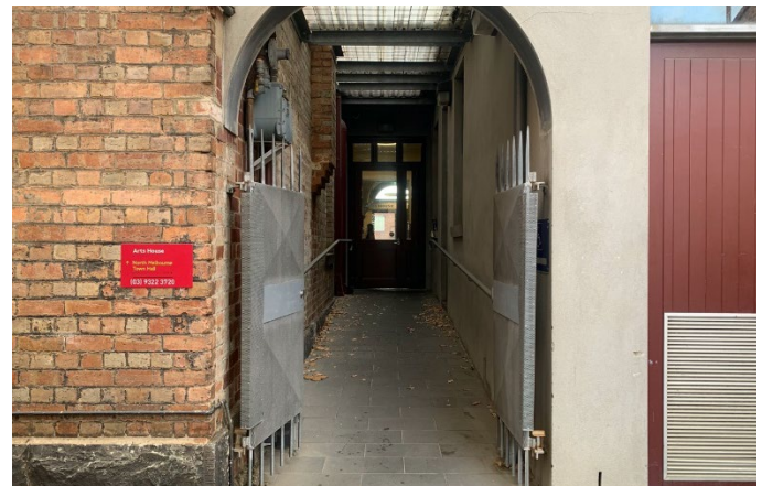
Image: view of the ramp leading from George Johnson Lane to the automated door which opens into the Arts House foyer.