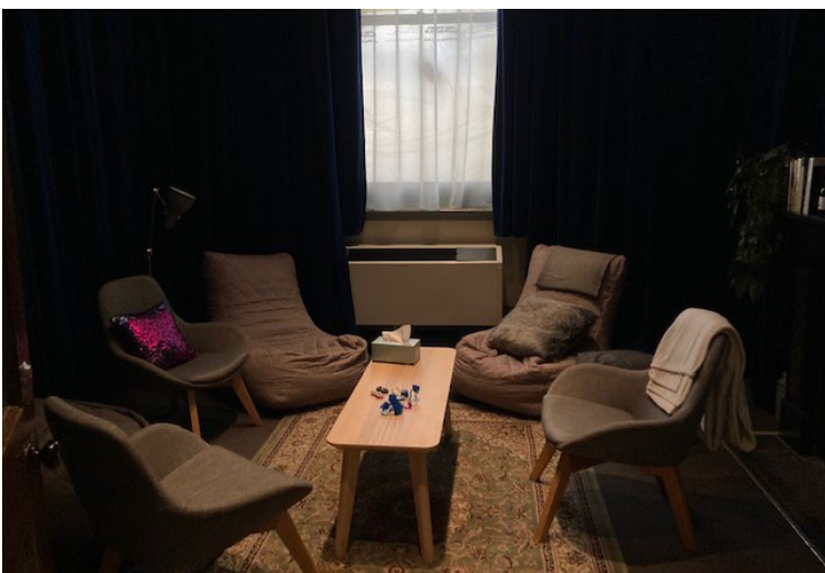
Image: Quiet Space with lights dimmed