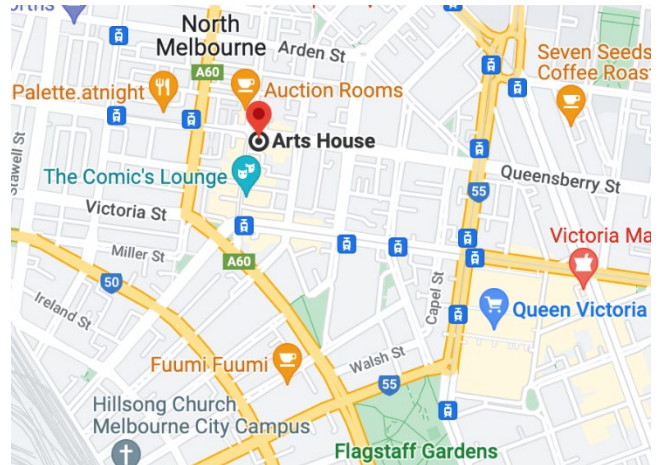
Image: a map of Arts House and its surrounding area. Link to map.