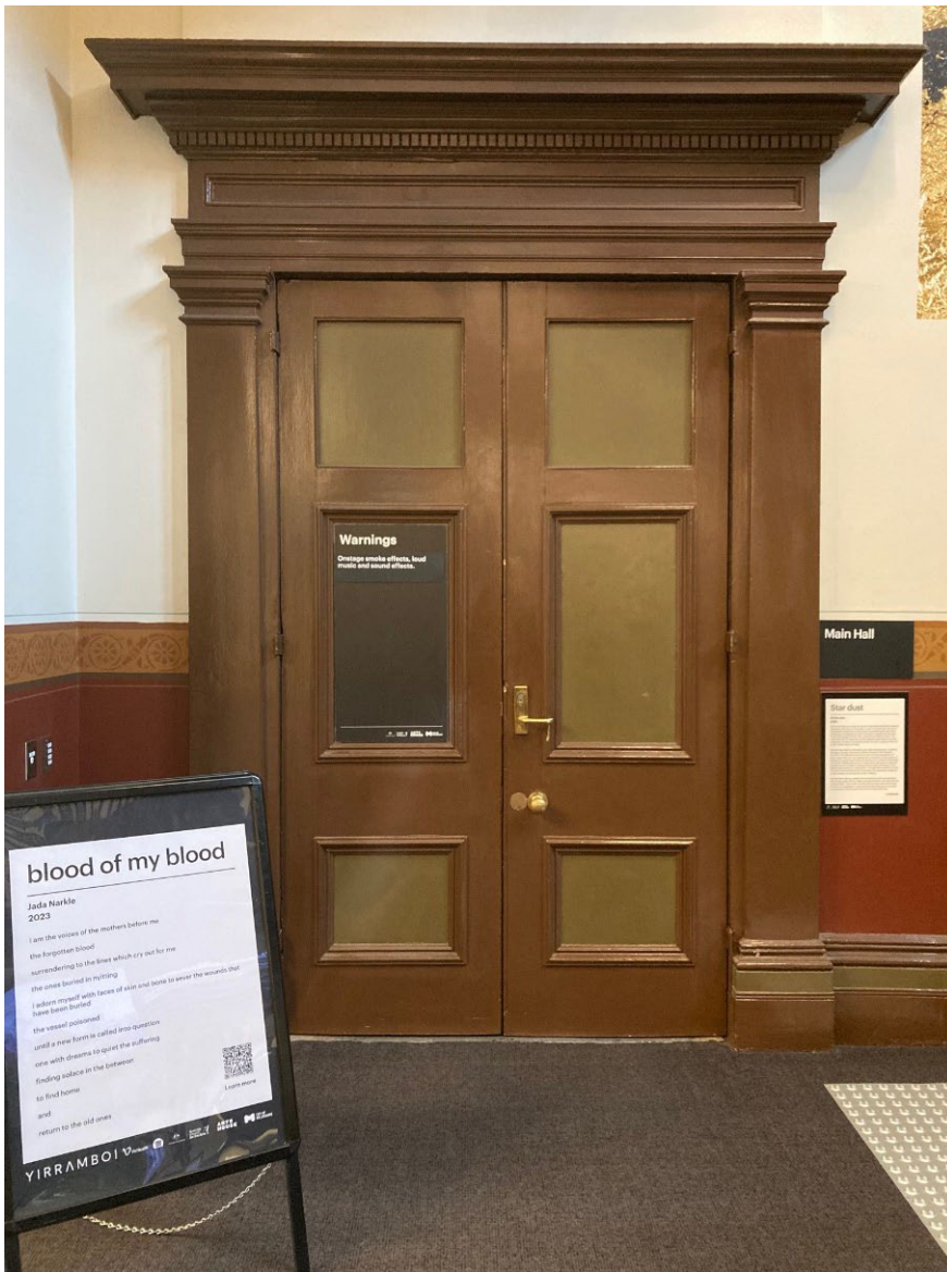
Image description: Photo of the Main Hall doorway. An artist statement is available on signage and warnings on the door.

The Performance is in the Main Hall. It is on the ground floor. It is to the left of the box office desk and right of the bar.