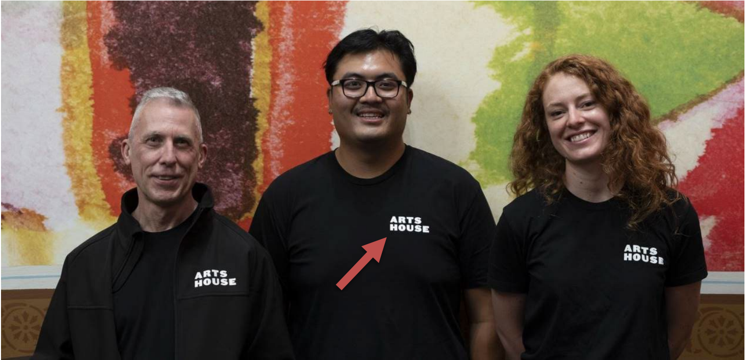
Image: Three Arts House Ushers.

Ushers will be wearing black with an Arts House Logo on the left hand shoulder.