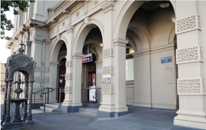
Image: Errol Street entrance next to the Post office. Ramp and handrails.

There are two Accessible Entrances. The first is on Errol St next to the Post Office.