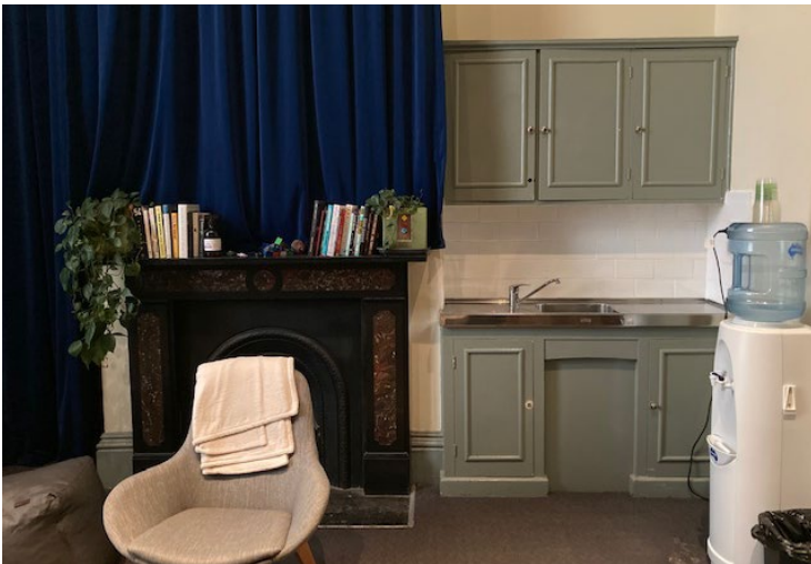
Image: Quiet Space kitchenette and shelf

Arts House Quiet Space is located on Ground Level and is nearby reception and opposite the accessible bathrooms. It includes a range of seating options including soft furnishings, dimmable lights, sensory and stim objects. It is open during venue opening hours and events as a quiet space, prayer or parenting space.