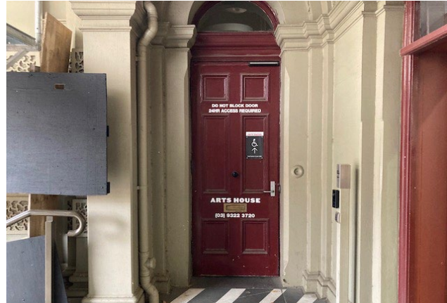
Image: View of door entrance.

The second Accessible Entrance is towards the end of George Johnson Lane.