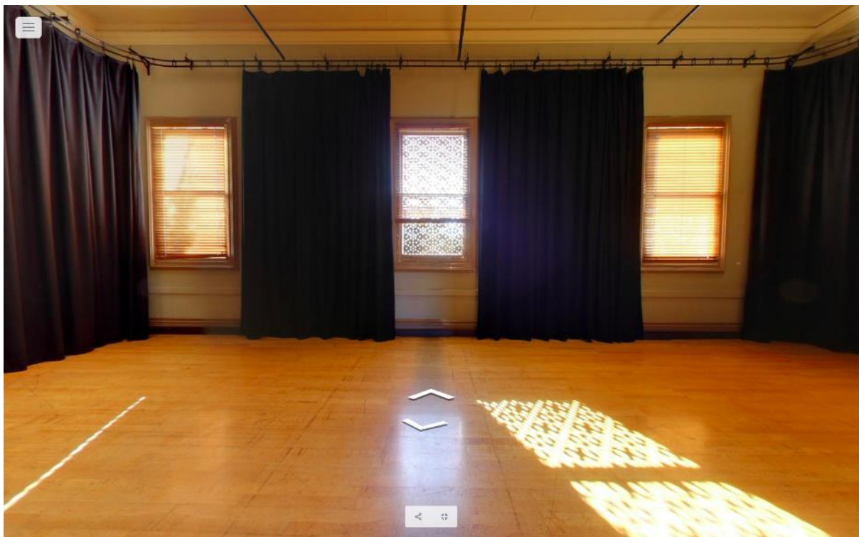
Image: a photo of Studio 1, looking from the doorway into the room. The floors are polished hardwood and black drapes separate three windows with natural light streaming through, on the opposite side of the room.

Studio 1 is suitable for a diverse range of activities including public talks, exhibition, medium-scale performances including dance, artist labs, projection, and more.