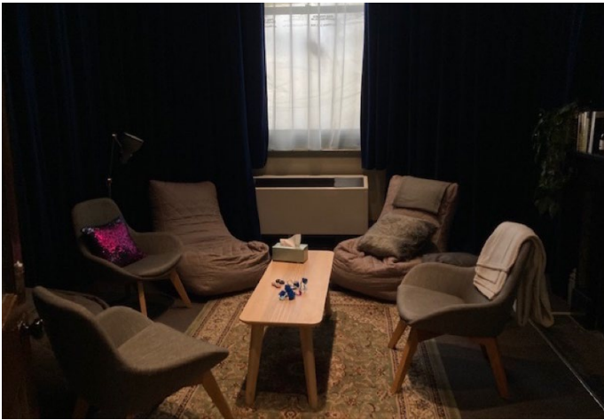
Image: Quiet space with lights dimmed

Arts House Quiet Space is located on Ground Level and is nearby reception and opposite the accessible bathrooms. It includes a range of seating options including soft furnishings, dimmable lights, sensory and stim objects. It is open during venue opening hours and events as a quiet space, prayer or parenting space.