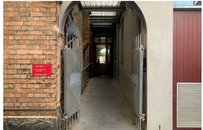
Image: view of the ramp leading from George Johnson Lane to the automated door which opens into the Arts House foyer.