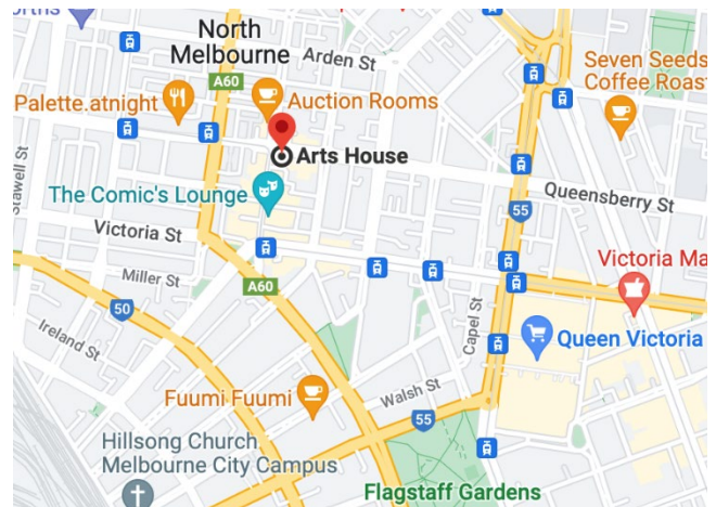
Image: a map of Arts House and its surrounding area. LINK TO MAP