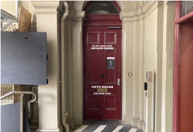
Image: View of door entrance.

The second Accessible Entrance is towards the end of George Johnson Lane.