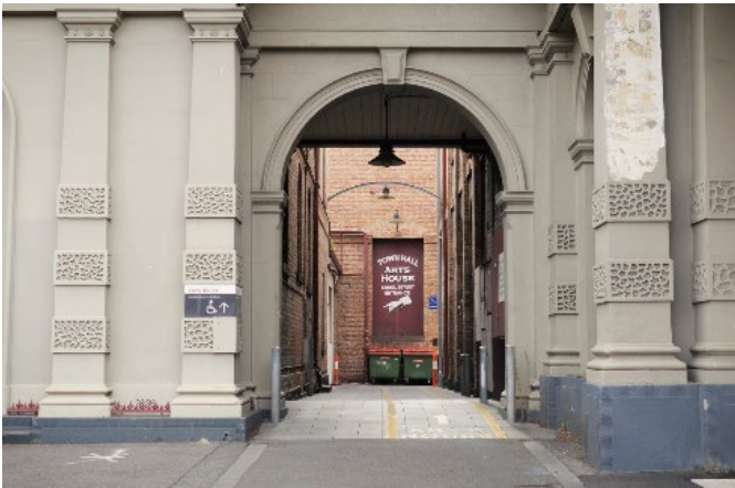
Image: View of George Johnson Lane from Errol St. The laneway passes through an archway with a brick wall at the end.

The second Accessible Entrance is towards the end of George Johnson Lane.