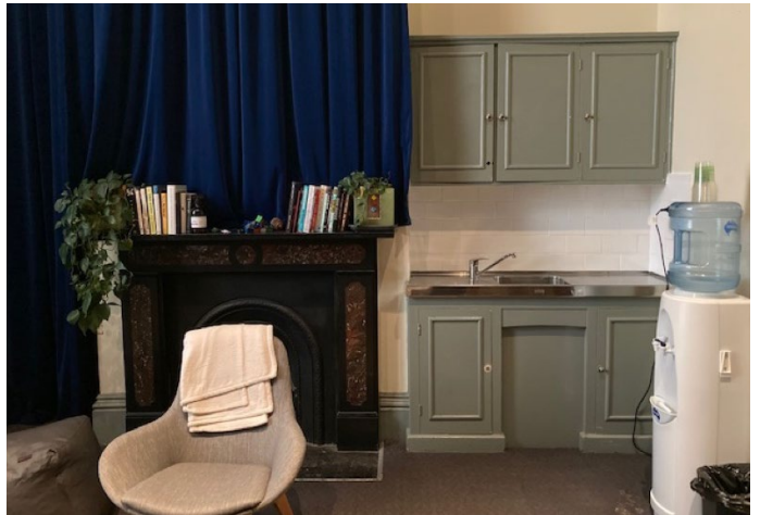
Image: Quiet space kitchenette and book shelf