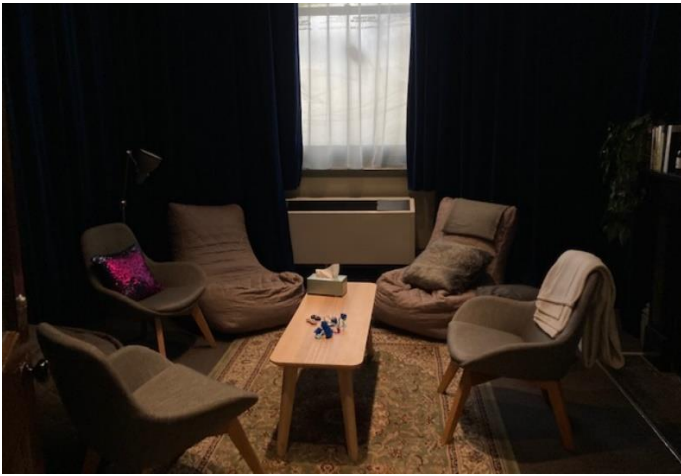
Image: Quiet space with lights dimmed

Arts House Quiet Space is located on Ground Level and is nearby reception and opposite the accessible bathrooms. It includes a range of seating options including soft furnishings, dimmable lights, sensory and stim objects. It is open during venue opening hours and events as a quiet space, prayer or parenting space.