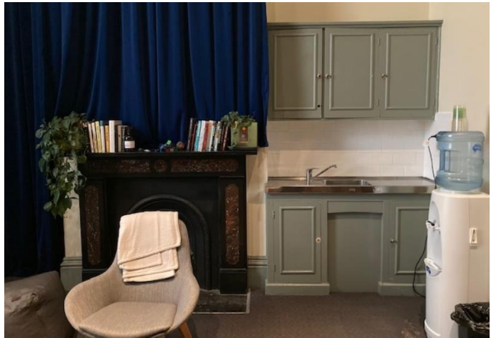
Image: Quiet space kitchenette and book shelf