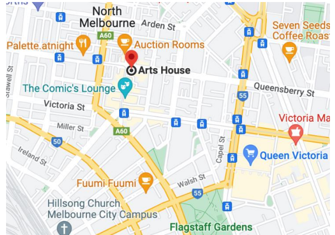
Image: a map of Arts House and its surrounding area. LINK TO MAP