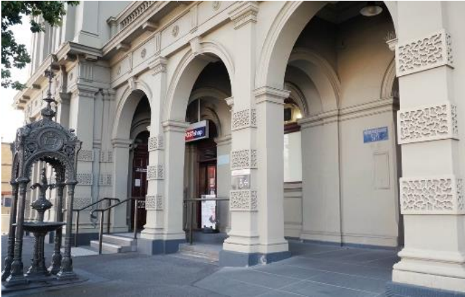
Image: Errol Street entrance next to the Post office with wheelchair accessible ramp or two steps with grab rails.

There are two Accessible Entrances. The first is on Errol St next to the Post Office.