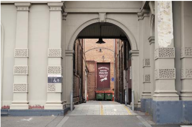
Image: View of George Johnson Lane from Errol St. The laneway passes through an archway with a brick wall at the end.

The second Accessible Entrance is towards the end of George Johnson Lane.