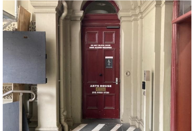
Image: View of door entrance.

The second Accessible Entrance is towards the end of George Johnson Lane.