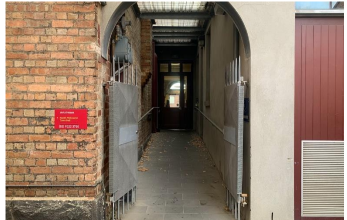
Image: view of the ramp leading from George Johnson Lane to the automated door which opens into the Arts House foyer.