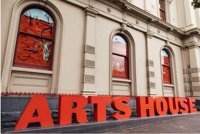
Image: North Melbourne Town Hall features giant red letters that say ARTS HOUSE out the front of it.